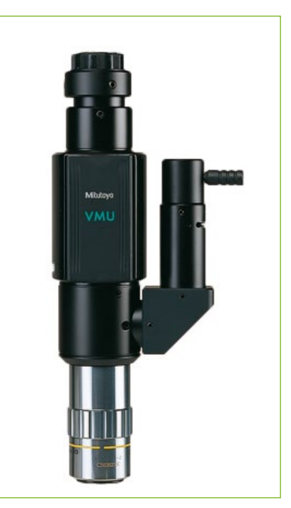
Fig. 3 Infinity-corrected semi-custom video microscope units hold various incorporated fluorescence filter cubes.

There is one complication, however. When optical elements are introduced into a converging or diverging beam, they modify the propagation, introducing tilt, defocus, or other aberrations.