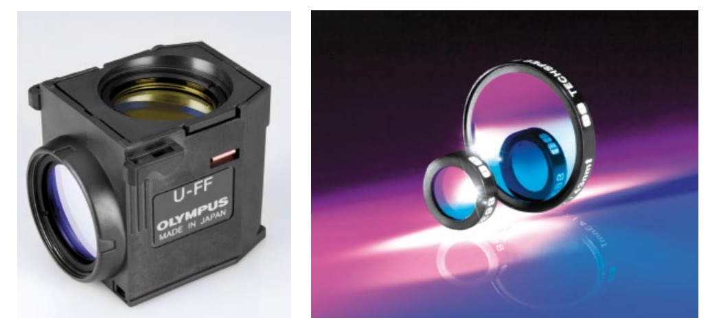
Fig. 1 Incorporating fluorescence filter cubes that hold various filters into an infinity-corrected microscope design can minimize costs and development time.

Some of these instruments will incorporate sophisticated optics directly into their design, but even those that don't will require the use of optics to develop