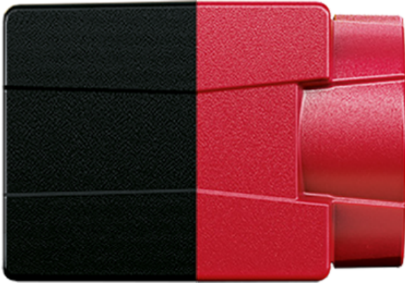
Hardware option: Closed Housing C-Mount