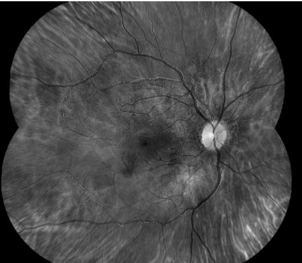
By employing the Annidis Corp. RHA instrument, users are able to detect early RPE changes and see the choroid like never before.