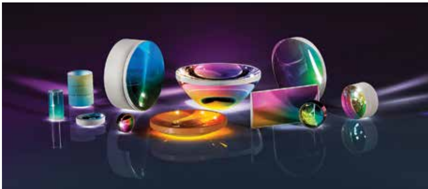
Using standard off-the-shelf optics in optical system design can save time and money from initial prototyping to volume production.

BY STEFAAN VANDENDRIESSCHE EDMUND OPTICS