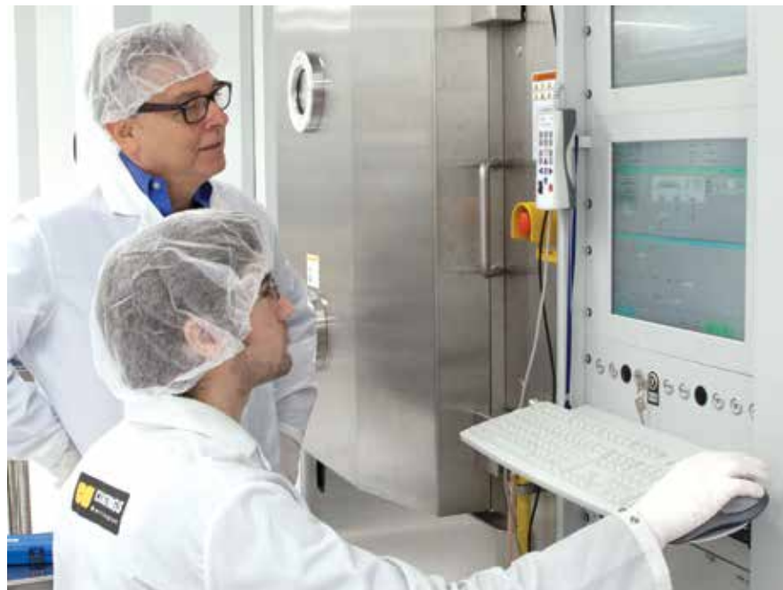
Modified stock optics, such as adding a custom coating, can provide the benefits of stock optics to designs where standard off-the-shelf optics don't meet the user's needs.

Engineering projects involving optical systems have the same time and money constraints as other engineering projects. Just as electrical engineers learned long ago that integrating standard resistors, capacitors and switches could save money and reduce time-to-market, optical design engineers are learning that leveraging the investment already made in designing, producing and stocking standard optics can provide similar benefits.