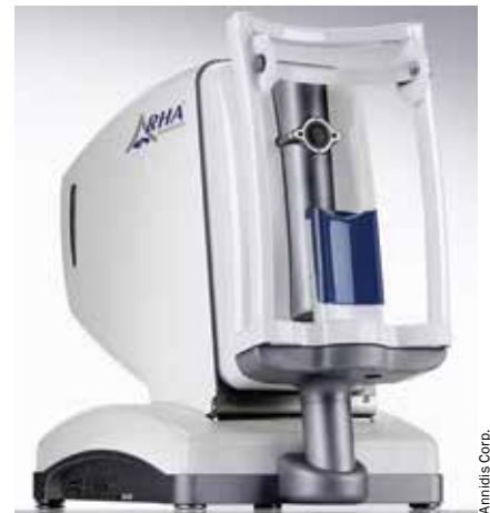
Annidis Corp.'s RHA instrument is a multi-spectral imaging digital ophthalmoscope with a patented optical system that captures high-resolution image data from the retinal and subretinal layers.

The large spectral range needed puts demands on the instrument's optical design — in particular, the challenge of providing broadband anti-reflection coatings and achieving satisfactory achromaticity. Stray light and surface contamination are also concerns because the optical energy received by the image sensor is much lower than that emitted by the LED